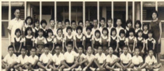
Kim Keat Primary School in the 1960s.

T HE opening of Curtin Singapore brought together not only the Curtin community, but also locals who are a part of the building's history.