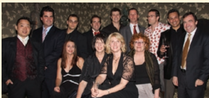
GSB Alumni Committee.

For further information regarding the alumni chapter, please contact Rebecca McCabe on 0408 830 323 or visit the website at: alumni.curtin.edu.au/chapters/gsb .