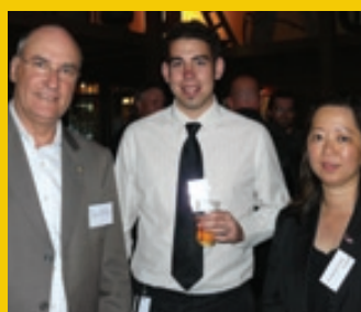
Information Systems alumni networking at the Moon and Sixpence hotel, Perth.