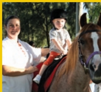
Alumni Family Movie Night at Movies by Burswood.