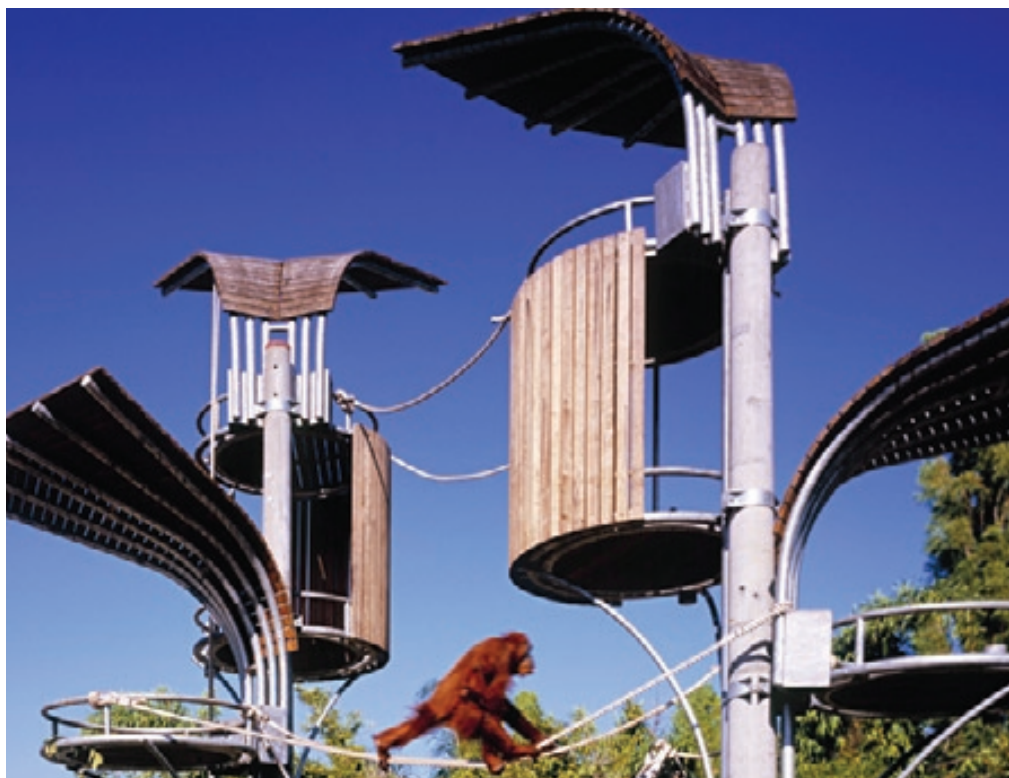
Orang-utan enclosure at Perth Zoo.

W HILE many speak of the vocational limitations in Western Australia, three Curtin Alumni know that where there's a will, there's a way; the architectural way. Perth-based architecture practice Iredale Pedersen Hook (IPH) has attained national and international fame, having won numerous awards across the globe.