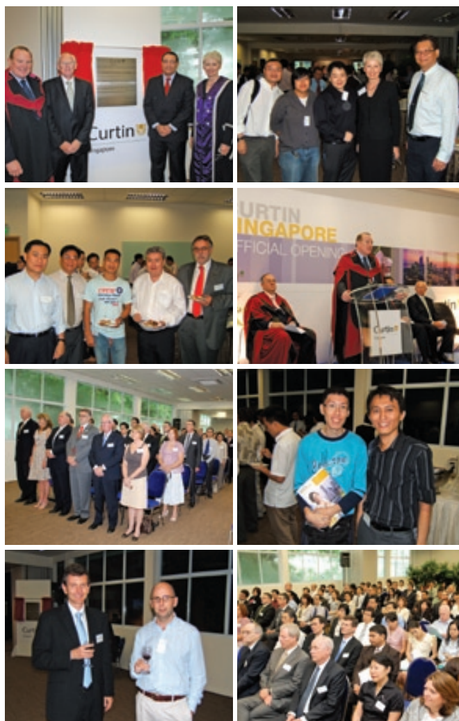
Curtin Singapore launch.