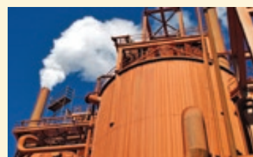
Queensland Alumina Limited.

Update your details now at alumni.curtin.edu.au/update to be a part of Curtin's global online reunion, and stay tuned for your alumni connection.