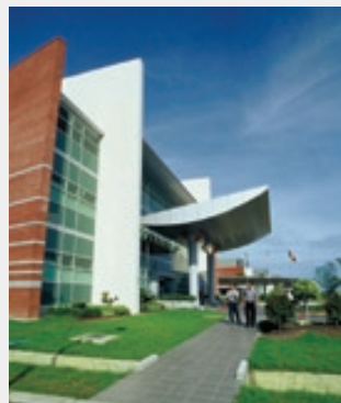
Curtin Sarawak Campus.

W HEN the 350 or so engineering and commerce students hold their graduation ceremony at Curtin's Sarawak Campus in April, it's likely to be a very big celebration indeed.